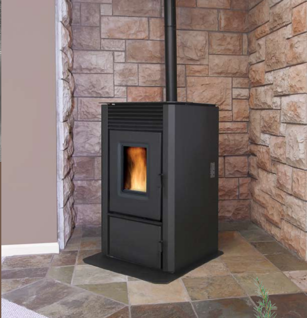
Extra Large Freestanding Pellet Stove