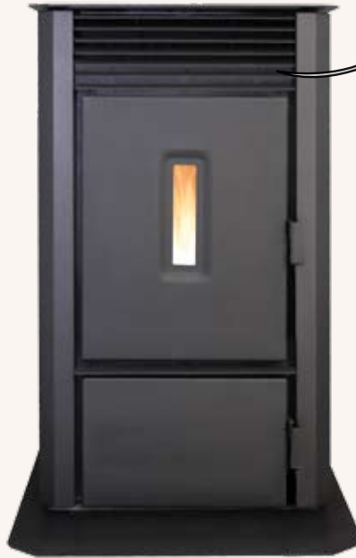
Enviro Maxx with Small Window